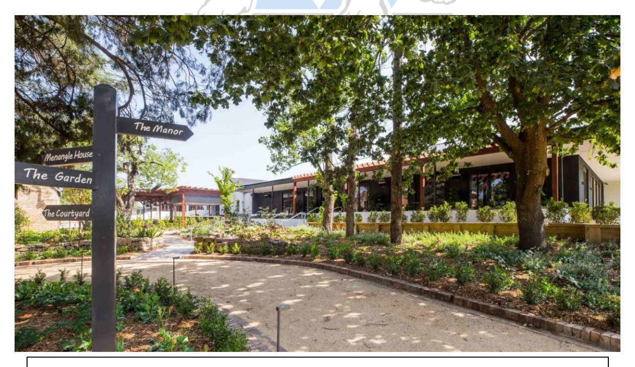
The exciting new facilities now on offer at Menangle Country Club

For more information on the wonderful facilities provided by NSW Harness racing, in particular TABCORP Park Menangle, please visit www.clubmenangle.com.au