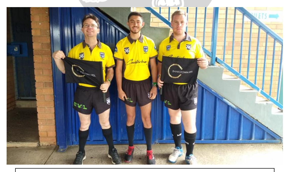
BANKSTOWN RSL sponsored touch judge flags

For further information on Bankstown RSL, please visit their website: www.bankstownrsl.com.au