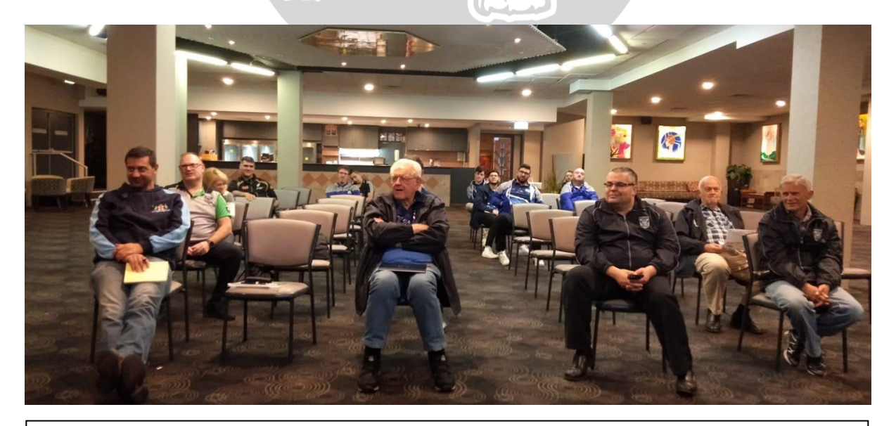
General Meeting's returned on Wednesday 15<sup>th</sup> July 2020, under strict COVID Safe protocols