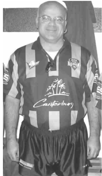
New on-field gear in 2006.

Three sets of new communications gear were also purchased to replace the ageing equipment. The new sets utilise a 2-wire airtube earpiece and lapel mike rather than a single wire system, which was prone to breakages. A new digital video camera was also purchased and used for recording referees' games.